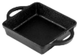
Cast iron Mini Square Skillet w/Handles