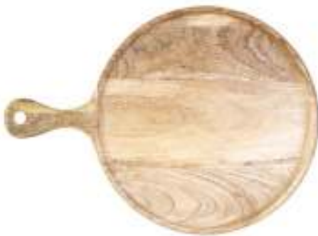
Serving Board Round with Handle - Natural