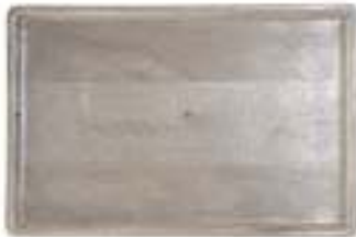
Serving Board Rectangular - Dark