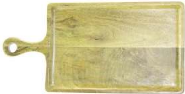
Serving Board Rectangular with Handle - Lime