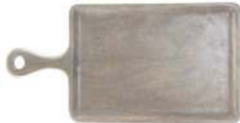
Serving Board Rectangular with Handle - Dark