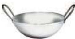
Kadai Bowl S/S