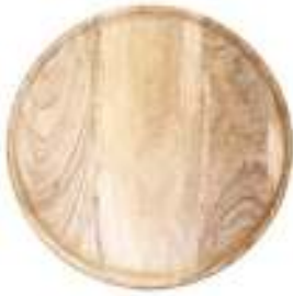
Serving Board Round - Natural