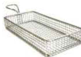
Rectangular Wire Basket with Handle