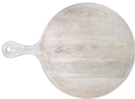
Serving Board Round with handle - White