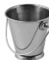
Mini Serving Pail with Foot