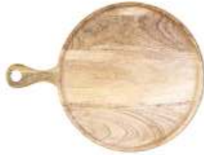
Serving Board Round with Handle - Natural