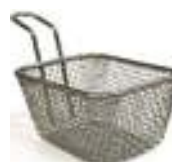
Rectangular Wire Basket with Handle