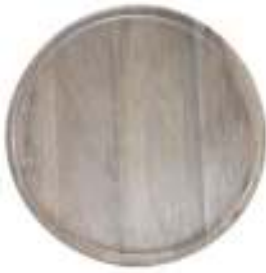
Serving Board Round - Dark