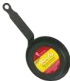
Blinis Pan High carbon Steel