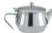
Princess Tea Pot 18/8