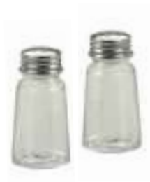
Salt & Pepper Shaker Glass