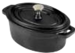
Cast Iron Mini Oval Casserole with Lid