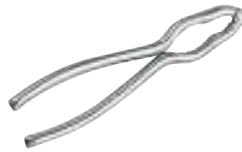
Cracker Nut/ Lobster S/S