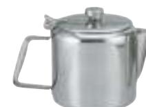
Teapot 18/8 Straight Sided