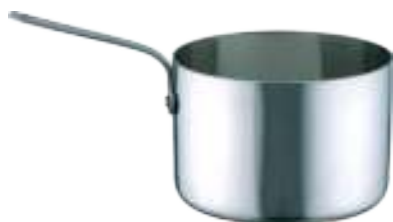
Saucepan 18/10 with S/S Handle