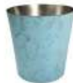
Patina Blue Pot - S/S Interior