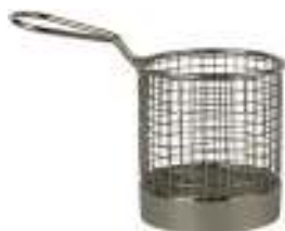
Round Wire basket with handle