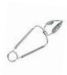
Snail Tong S/S