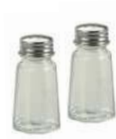
Salt & Pepper Shaker 18/8 - Mini Jumbo