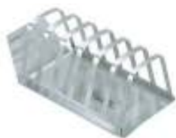
Toast Rack S/S with Base 6 Slice