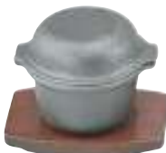
Cast Iron Garlic Prawn Pot