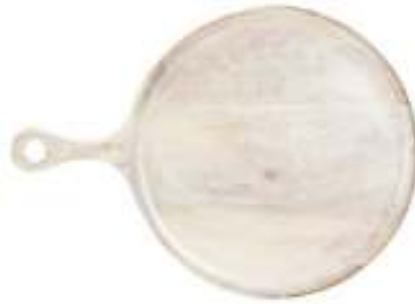
Serving Board Round with Handle - White