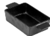
Cast iron Mini Rectangular Baker