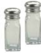
Salt & Pepper Shaker Glass with S/S Top