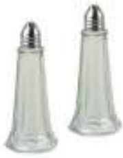
Salt & Pepper Shaker Glass - Tower