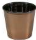
Copper Pot S/S Interior