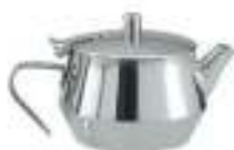
Princess Teapot 18/8