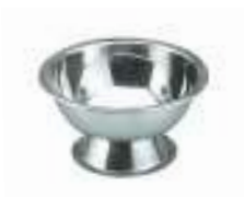
Sundae Dish S/S