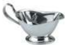
Gravy Boat 18/10