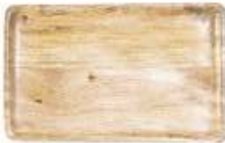
Serving Board Rectangular - Natural