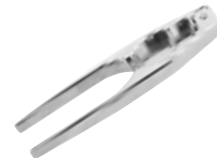
Cracker Nut/Lobster S/S "Skylab"