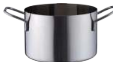
Casserole 18/10 with S/S Handle