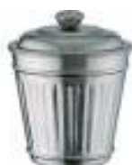
Trash Can Ribbed 18/10