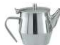
Princess Coffe Pot 18/8