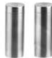
Salt & pepper Shaker 18/10