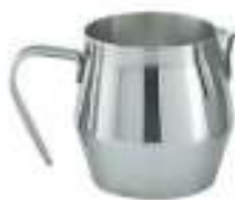
Princess Creamer 18/8