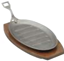
Steak Sizzler Cast Iron - Grey Finish with handle