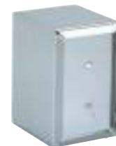
Napkin Dispenser S/S E Fold