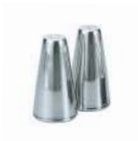
Salt & Pepper Shaker 18/10