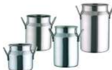
Milk/Sauce Serving Churn 18/10