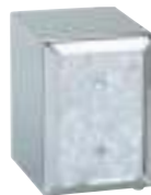
Napkin Dispenser S/S D Fold