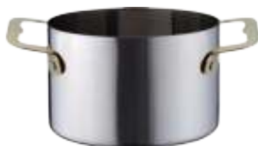
Casserole 18/10 with Brass Handle