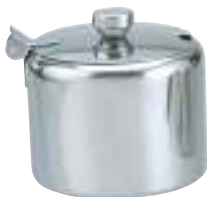
Sugar Bowl with Hinged Lid