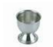
Egg Cup S/S