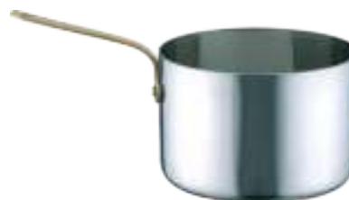
Saucepan 18/10 with Brass Handle