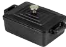
Cast iron Rectangular Baker with Lid