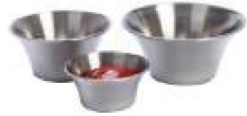
Flared Sauce Cup S/S