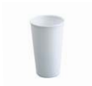
Milkshake Cup Polypropylene asst. Colours