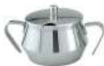
Princess Sugar Bowl 18/8