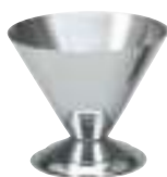
Seafood Cocktail S/S Conical