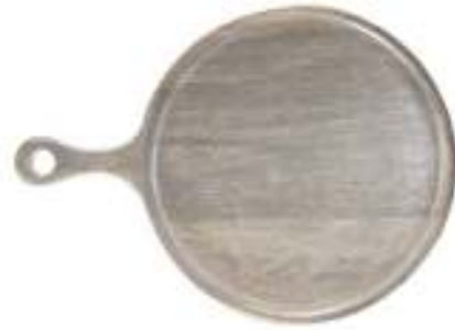
Serving Board Round with Handle - Dark