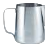
Creamer 18/8 Elegance