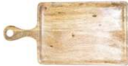
Serving Board Rectangular with Handle - Natural