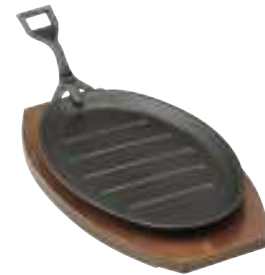
Steak Sizzler Cast Iron - Black