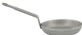
Blinis Pan Black Steel