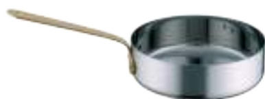
Frypan 18/10 with Brass Handle