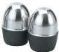
Salt & Pepper Shaker S/S