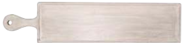
Serving Board Rectangular with Handle - White