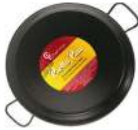
Paella Pan - Enamelled