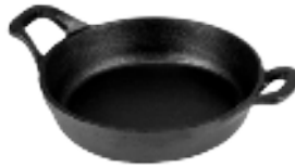
Cast iron mini Round Gratin with Lid