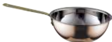
Wok - Copper with Brass Handle