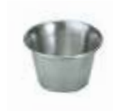
Sauce Cup S/S