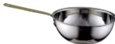
Wok 18/10 with Brass Handle