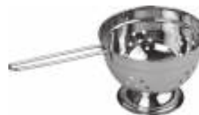
Colander with Long Handle 18/10