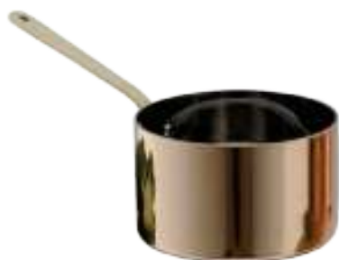
Saucepan -Copper with Brass Handle