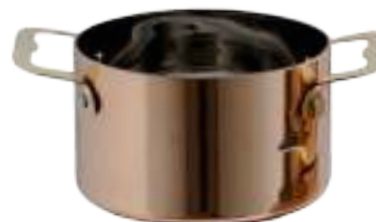
Casserole - Copper with Brass Handle