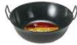
Paella Pan - Enamelled Deep