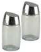
Salt & Pepper Shaker - City Squire