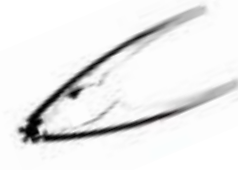
Cracker Nut/ Lobster Chrome