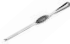
Lobster Pick S/S