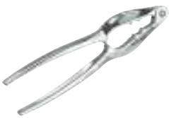
Cracker Nut/ Lobster Chrome