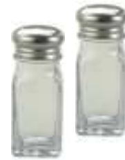
Salt & Pepper Shaker Glass with S/S Top