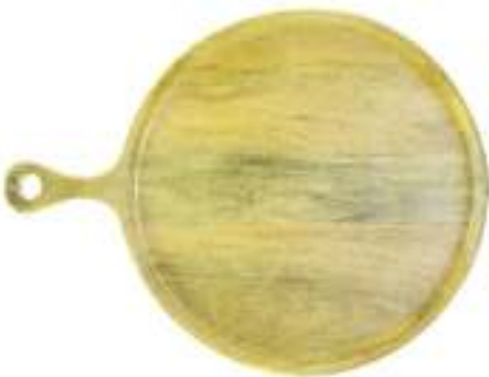
Serving Board Round with Handle - Lime