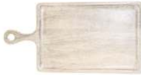
Serving Board Rectangular with Handle - White