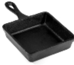
Cast Iron Mini Square Frypan