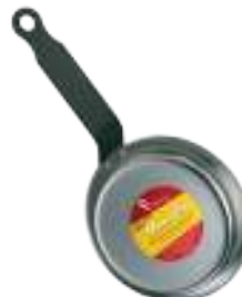
Blinis Pan High Carbon Steel - Non Stick