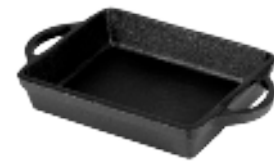
Cast Iron mini Rectangular Skillet With Handles