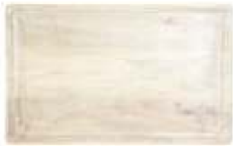
Serving Board Rectangular - White