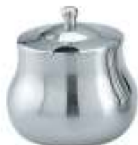
Regal Sugar Bowl 18/8