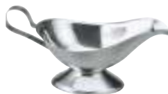
Gravy Boat S/S