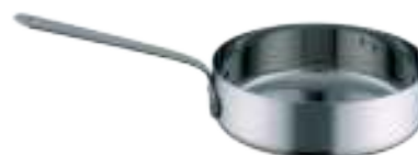
Frypan 18/10 with S/S Handle