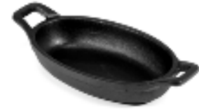
Cast Iron Mini Oval Au Gratin W/Handles