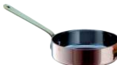
Frypan Copper with Brass Handle