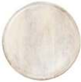
Serving Board Round - White