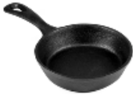
Cast Iron Mini Frypan