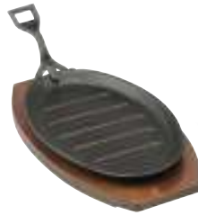
Steak Sizzler - Cast Iron