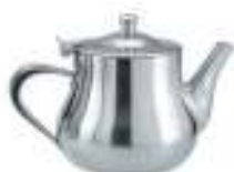
Regal Tea Pot 18/8