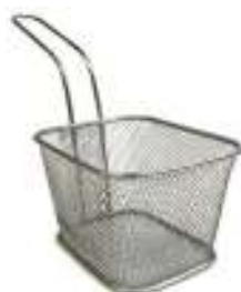
Rectangular Wire Basket with handle