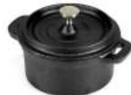
Cast iron Mini Cocotte with Lid