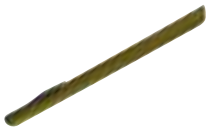
Crumb Sweeper Aluminium