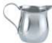
Creamer S/S Bell Shape